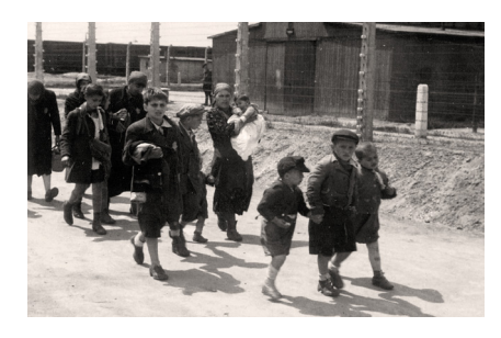
Hungarian Jewish children walking to the gas chamber in Auschwitz-Birkenau.

At the time of the Wannsee Conference in January 1942, Nazi Germany was already preparing for the mass murder of the approximately two million Polish Jews in the occupied part of Poland. An extermination camp was set up in Chelmno in western Poland in