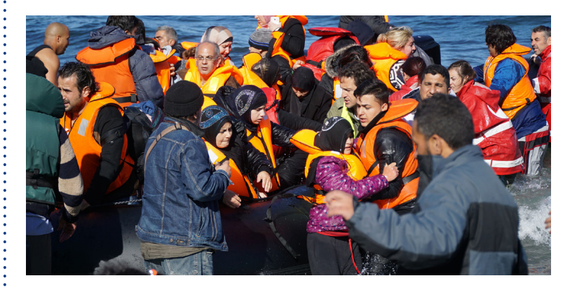
2020: Refugees crossing the Mediterranean, seeking asylum in Europe.

Although people flee for a variety of reasons, not everyone is officially a refugee. The terms refugees, asylum seekers and migrants are often used interchangeably and confused with each other, despite each having a distinct meaning. What are the differences?